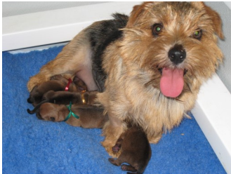
Tenterra California Girl