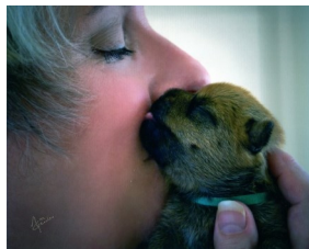
Wisdom's Gate Tenterra Carmel